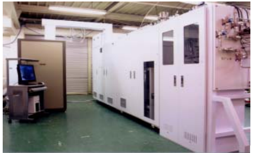
MOCVD system ( SH2001 ) for InGaPN