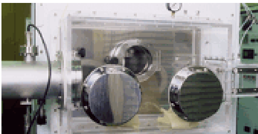
The box with gloves